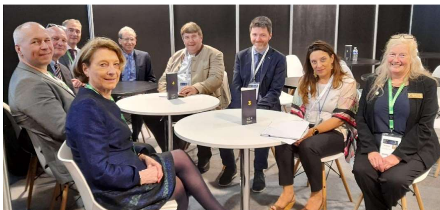
Chapter Presidents’ / Representatives Meeting at AOC Europe 2022 (From left to right: France, Norway, Switzerland, Holland, Israel, Germany, Czech Republic, Italy, UK)

A meeting of chapter representatives took place with presidents or representatives from 9 chapters, including the newest AOC chapter, the Bohemian chapter from the Czech Republic.