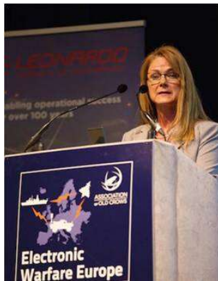
AOC Past-President at EW Europe