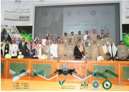
Award winners at the EWKSA Conference in Riyadh

One of the newest chapters in our region is located in the Kingdom of Saudi Arabia. This chapter also organises a biennial conference held at the King Abdulaziz City for Science and Technology in Riyadh. In December 2017 the conference had an excellent technical content with 41 presentations, mostly by experts from Saudi Arabia. A well-attended exhibition accompanied the conference with over 25 international companies taking part.