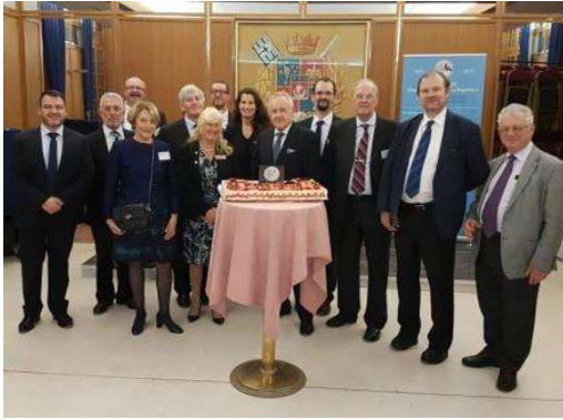
Members of the Lafayette chapter at their 20 th birthday party