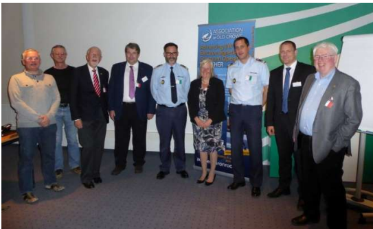
The Board of Directors of the Red Baron Roost

A typical Red Baron meeting was held at the Fraunhofer Institute in Wachtberg near Bonn in April 2017. More than 40 AOC members enjoyed an interesting and informative evening with an excellent technical program on the theme of “Digitisation of Weapons Systems – Cyber Awareness”.