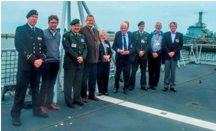
The Board of Directors of the new De Ooeivaar Chapter

To finish our tour of international region 1 we return to Europe where our newest chapter, the “De Ooeivaar” chapter held their inaugural meeting in July 2018 aboard the frigate Zr Ms Tromp in the Den Helder naval base in the Netherlands.