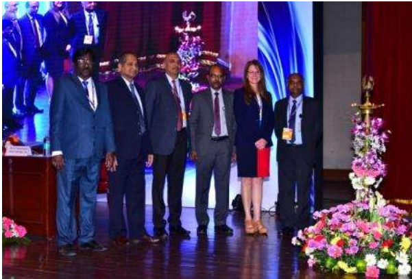
Board of Directors of the India Chapter with the AOC President at EWCI 2018 Conferen

At the eastern end of our region the India chapter holds a conference in Bengaluru every two years. In February 2018, the 3-day conference attracted more than 300 attendees and comprised over 76 technical papers and 10 invited talks. A pre-conference workshop day included courses by several eminent EW professionals from around the world.