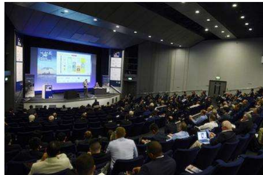
Delegates at EW Europe

Every two years in November it is good to escape the wintry weather in the Northern hemisphere and pay a visit to the Aardvark Roost conference held at CSIR in Pretoria.